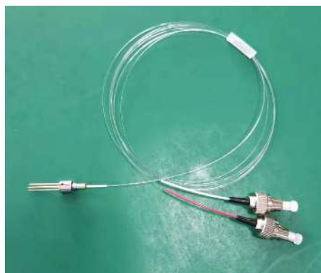
PD TO Can Dual balance pigtail PD