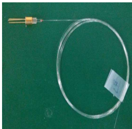
MEMS VOA pigtail TO CAN