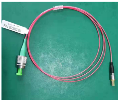
TO CAN Pigtail Tunable Laser

Below are some sample we made TO-CAN packaging for our customers.